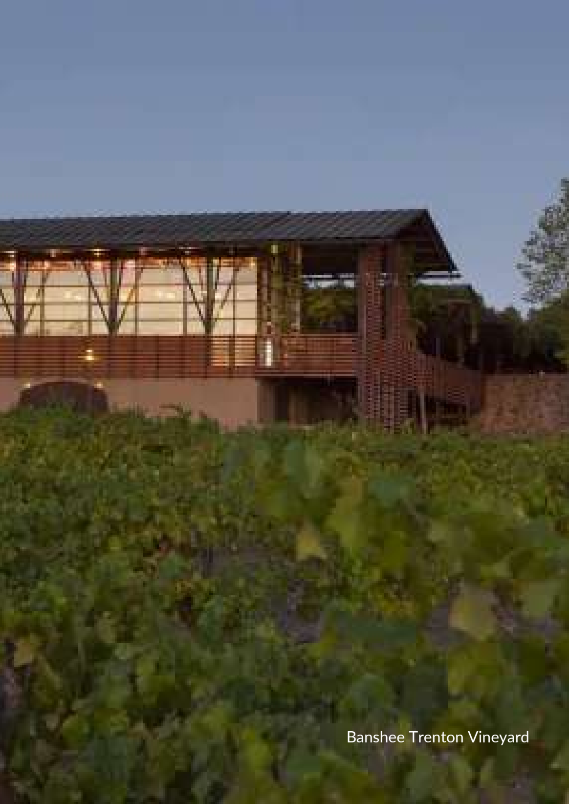
Banshee Trenton Vineyard