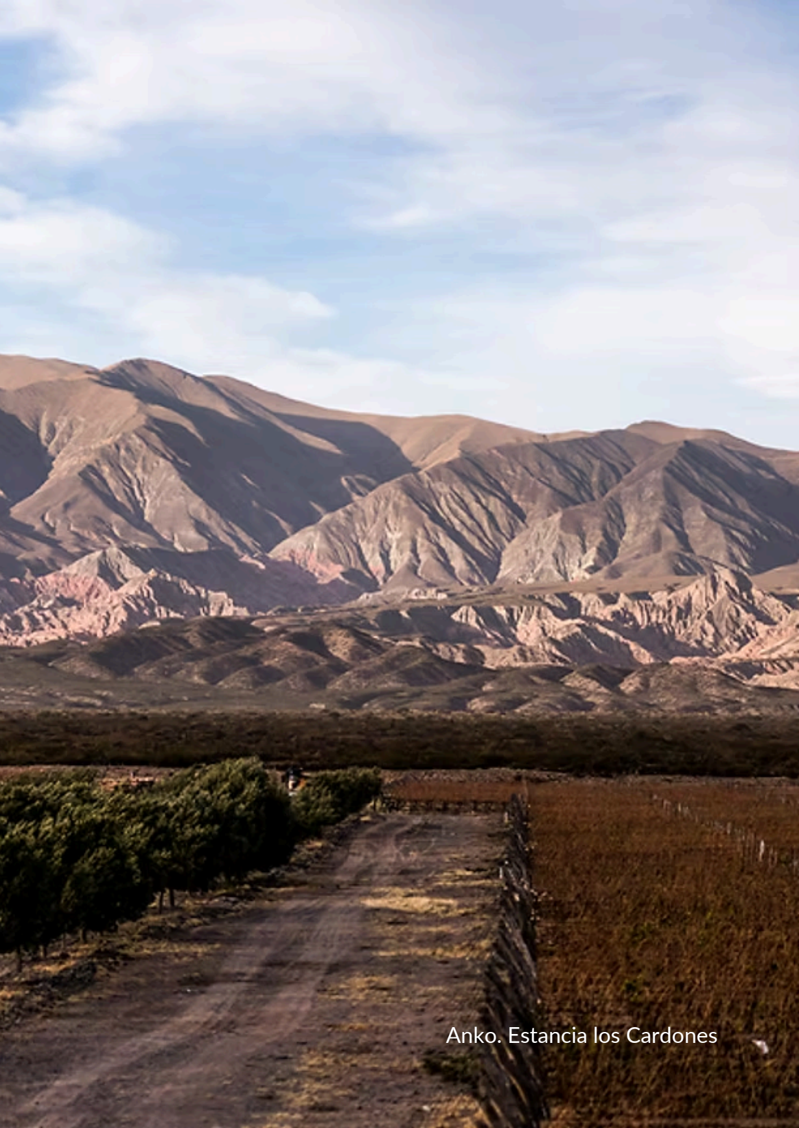
Anko. Estancia los Cardones