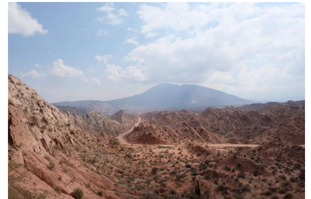
The road to Cachi

What better way then by partnering with other high altitude, limited production wineries to share this distinctive style of wine with the rest of the world?